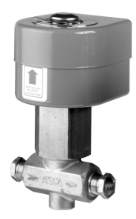
TYPE M SOLENOID PILOT